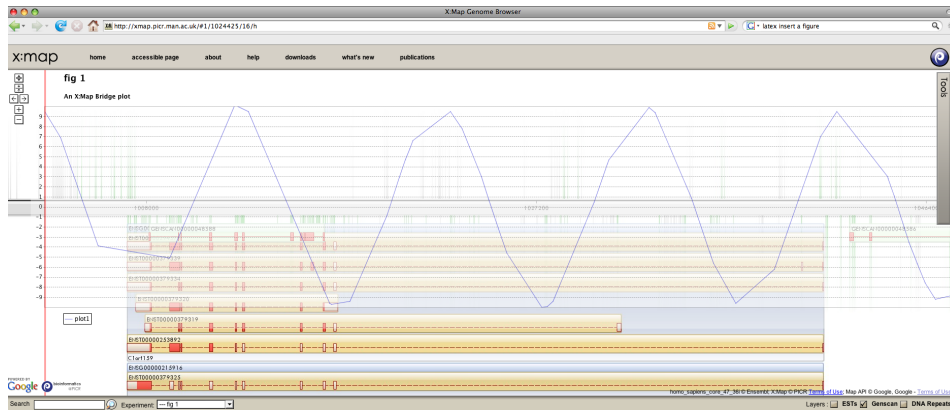
Figure 3: X:Map displaying a simple graph

on human chromosome 1. As you can see from the output, it actually starts at location 1,103,015bp due to the runif . (In the following section more complex examples show how to generate graphs for real (Affymetrix exon) array data).